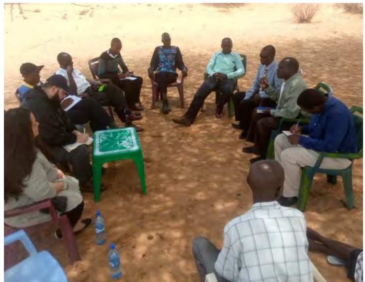
Planning meeting with local church leaders

Join us in prayer as God leads us further into the remote corners of Kenya!