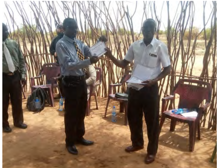
Elder Credential presentation

Once the construction of a Solar Water System is completed, there are plans to introduce Conservation Agriculture to the nomadic people of Turkana to help address food insecurity. This comes as a result of the people expressing their desire and willingness to learn new farming techniques. The Turkana area experiences periods of prolonged drought. Despite recent rains which lasted for about a week – the first significant rainfall since 2020 – this part of the country is typically dry and semi-arid.