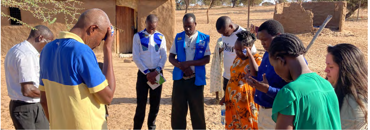
Praying with a project beneficiary