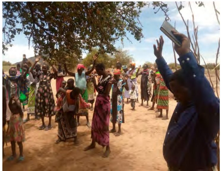
Praising God with church plant members