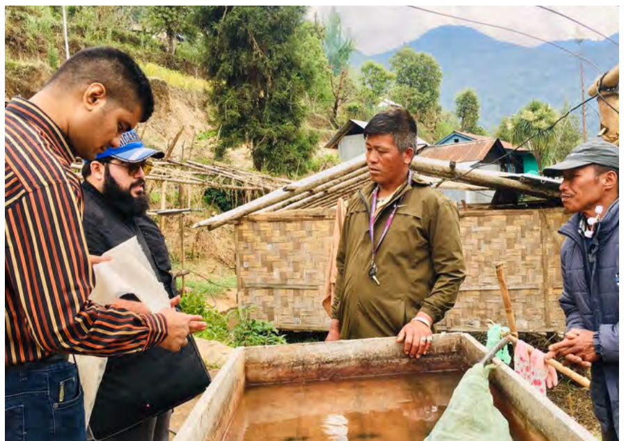
Learning about paper making as an Income-Generating Activity (IGA)

More stories and project updates available on our social media.