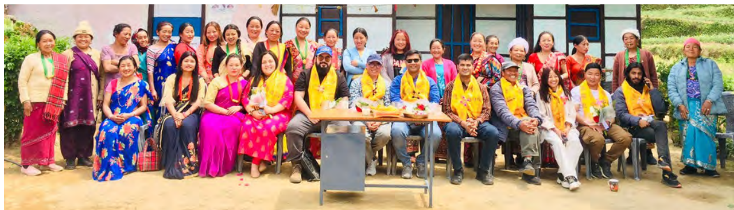
Meeting with an all women's Self-Help Group

Since joining the agriculture and livelihoods project being implemented by NCM Nepal, the people's perception of outside groups – in this case, the church - has changed for the better. The chair of the SHG expressed her gratitude towards the church (NCM) for their integrity in carrying out this project. The Kirat religion, a form of animism, is the dominant religion in this part of the country. As ministries of compassion are being implemented, the perception of the church is gaining strength. In turn, with intentionality and over time, people seek to learn more about the church. Many times, it is the project staff who are the evangelists, leading people to Christ and linking them to a local church to plug into. Join us in praying for NCM project staff and volunteers as they witness to people from all walks of life, in word and deed!